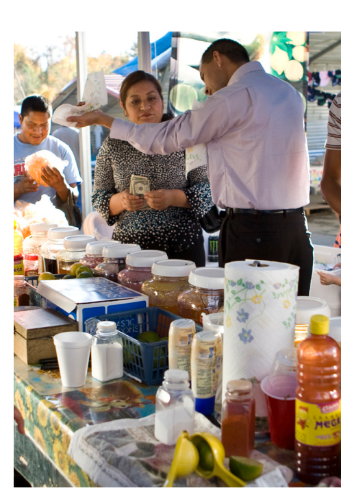
La Familia en la Cocina. This research project looks for patterns in the diet and culinary practices of foreign born inmigrants who are raising their kids in America.

The Research and Evaluation Department evaluates program services and assesses community need for a variety of partners. Currently, the Research and Evaluation Department has been able to produce at least one manuscript annually in peerreviewed academic journals on a variety of topics including workforce enhancement, program efficacy, and social marketing. The Research and Evaluation Department has also crafted multiple reports for the community and funders to describe best practices and regional assessments.