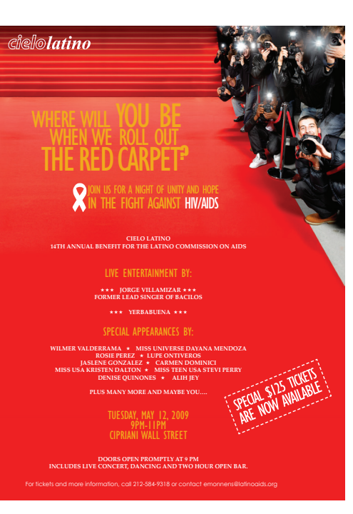
Ad in the Daily News of the Cielo Latino fudraising event to promote discounted tickets after selling table seats.

Since it's inception in 1995, Cielo Latino, the largest national fundraiser of its kind, has raised nearly $8 million to fight AIDS in Latino communities. In its 14th year, Cielo Latino raised funds needed to support the Commission's response to the health crisis due to HIV/AIDS by addressing the critical, unmet prevention and care service needs of Latinos/Hispanics.