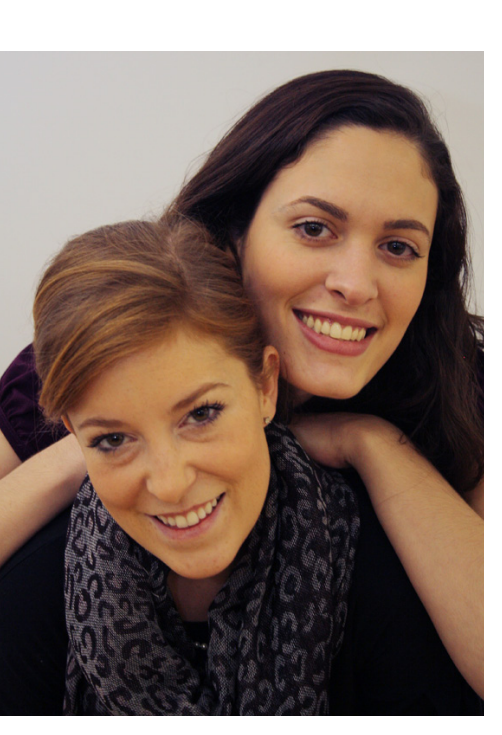
Insights. An intervention model packed by the Translating Research Into Practice, Insights promotes the use of condoms among women who are sexually active in a non-monogamous relationship.

The Commission developed the Hispanic Health Behavioral Research Center in 2008 as a community-based participatory research endeavor of the Research and Evaluation Department. The Hispanic Health Behavioral Research Center works with programs inside the Commission and with other communitybased and academic institutions to identify research questions, develop research protocols, collect and analyze data, and publish findings. Since 2008, the Hispanic Health Behavioral Research Center team has: obtained additional support for research projects; written four articles that have appeared in academic peer-review journals; presented at nine academic and professional conferences; and developed evaluation reports on five community-based projects.