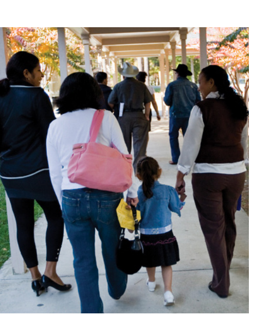
Latinos in the Deep South. This program conducted many community mappings to better understand the health needs of the growing Latino immigrant population.