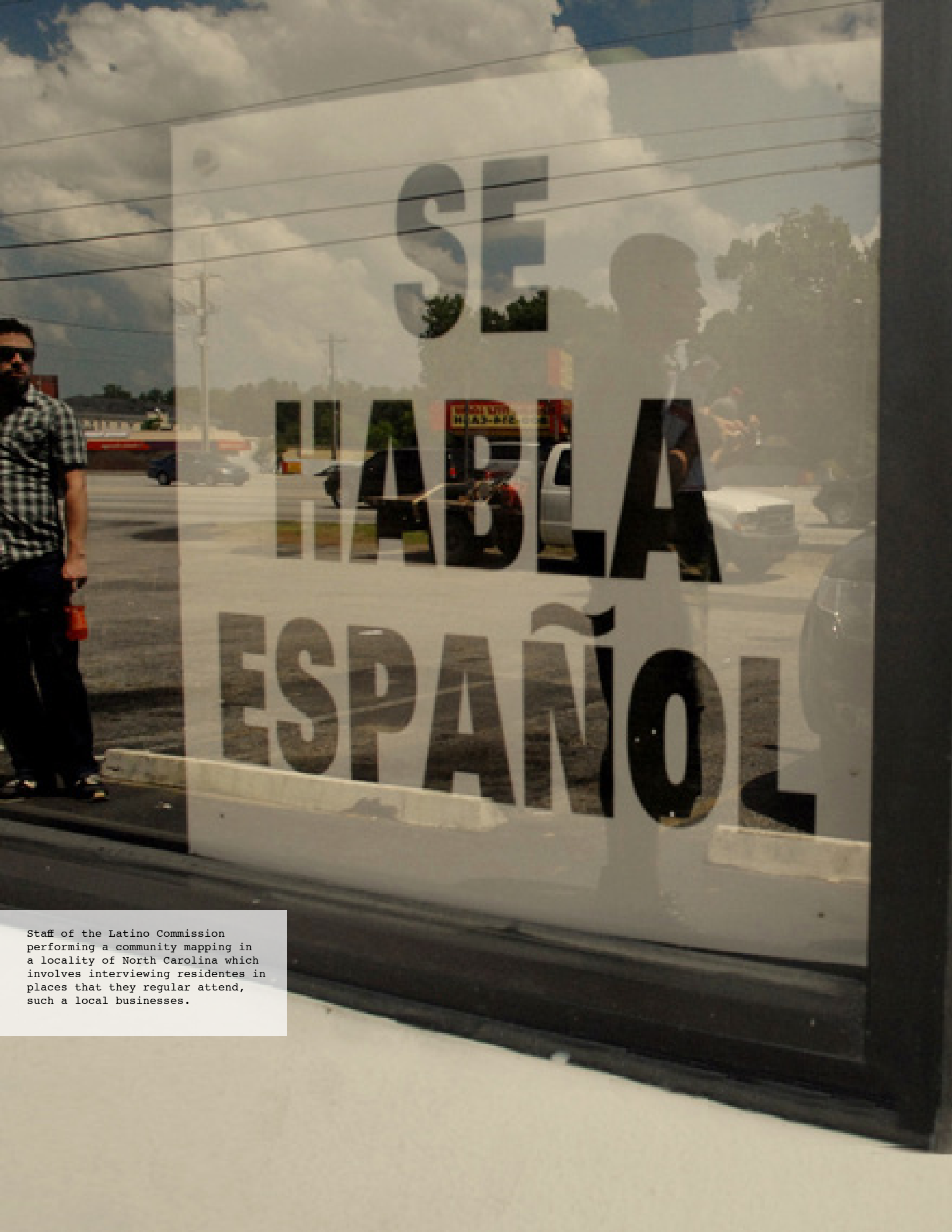
Staff of the Latino Commission performing a community mapping in a locality of North Carolina which involves interviewing residents in places that they regular attend, such a local businesses.