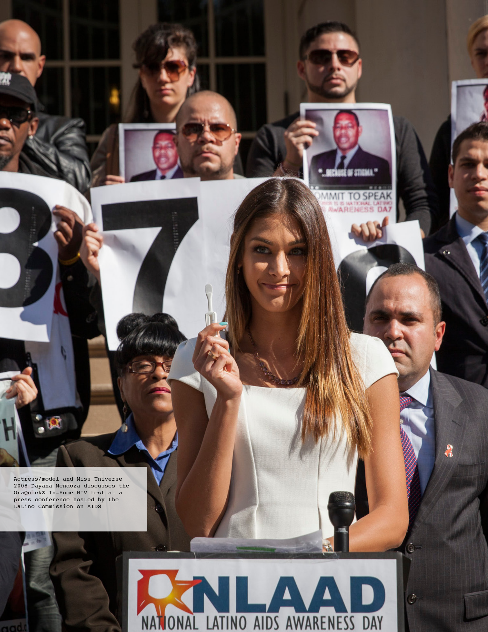
Actress/model and Miss Universe 2008 Dayana Mendoza discusses the OraQuick® In-Home HIV test at a press conference hosted by the Latino Commission on AIDS

NLAAD NATIONAL LATINO AIDS AWARENESS DAY