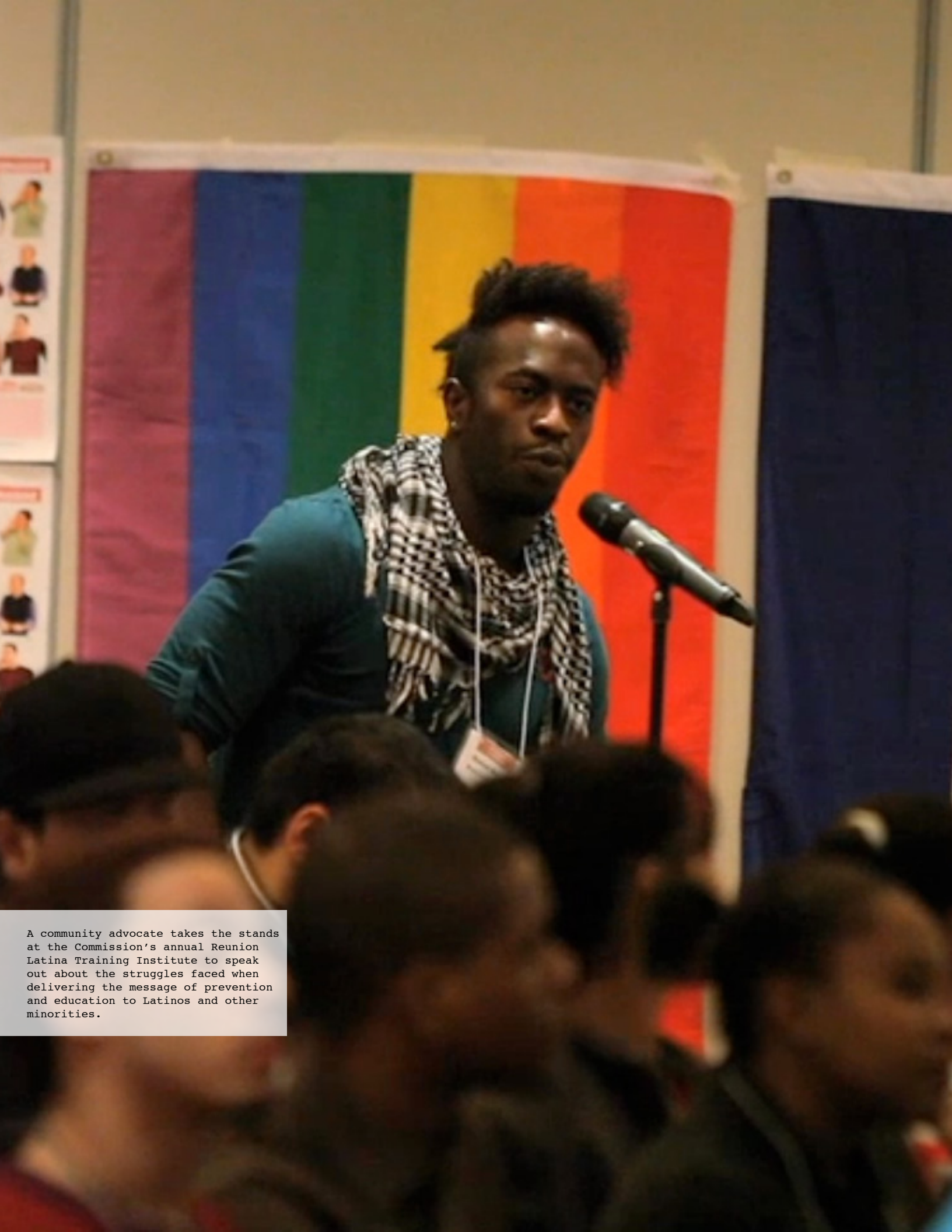
A community advocate takes the stands at the Commission's annual Reunion Latina Training Institute to speak out about the struggles faced when delivering the message of prevention and education to Latinos and other minorities.